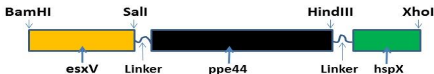
Fig. 1. Schematic illustration of synthetic construct. The AEAAAKEA linkers and different enzyme cutting sites were placed between the selected genes.